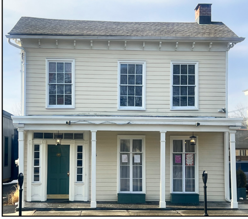
All are welcome, but please register <u>HERE</u> to ensure we can provide an adequate amount of provisions and libations!

We officially moved in September. After being in a small office for so long, there were so many things needed and we would like to highlight the following members and neighbors who provided us what we needed: Village of Warwick Department of Public Works for the beautiful renovation; Village of Warwick Water